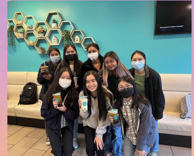
PharmClans Reveal 2022