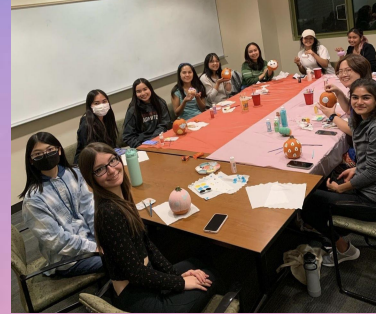
Pumpkin painting social w/ GMB!